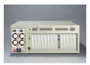
Rear view of IPC-610BP-H