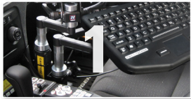
ATTACHES TO MOST INDUSTRY MOUNTS