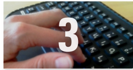
UNPARALLELED TYPING COMFORT