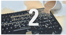
SEALED SURFACE RESISTS FLUIDS AND DIRT