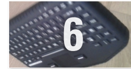
BUMPER DESIGN FOR RESILIENCE