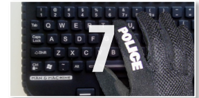
BOTH KEYS AND TOUCHPAD