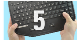
CLEAN WHILE CONNECTED