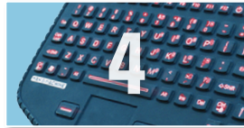
SET RED BACKLIGHT TO DESIRED INTENSITY