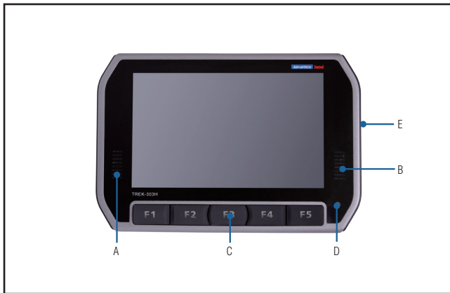
A. B. Speaker C. User-defined hotkeys D. Light sensor E. Reset, power, USB host (side)