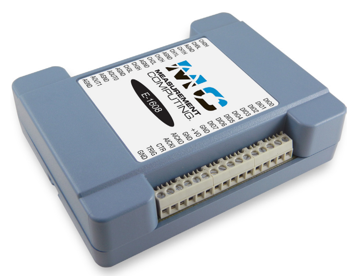
The E-1608 offers high-speed analog input over an Ethernet inetrface, two analog outputs, eight digital I/O, and one event counter input.