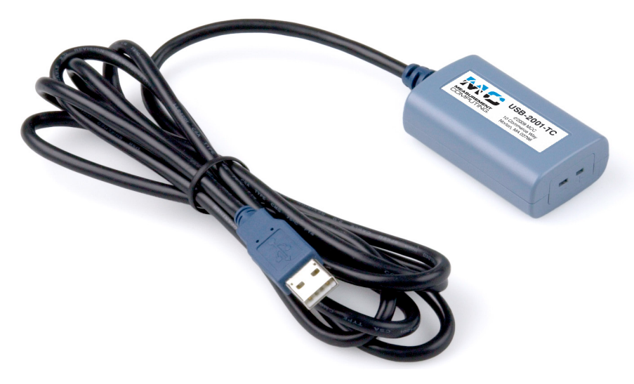
The USB-2001-TC provides reliable temperature measurement at an affordable price