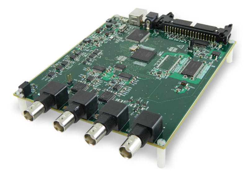
The USB-2020 offers high-speed simultaneous sampling at rates up to 20 MS/s per channel to onboard memory.